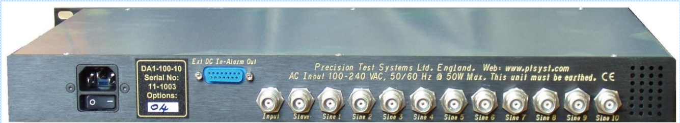
DA1-100-10 Rear view (with option 04 TNC Connectors). 1U case type. 2U case is double the height.

Precision Test Systems also manufactures the PTS50 and DA1010 series of distribution amplifiers. These models are lower cost alternatives to the DA1-100-10 but still give very good performance.