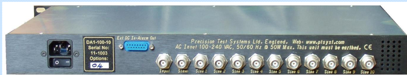
DA1-100-10 Rear view (with option 04 TNC Connectors).

Precision Test Systems also manufactures the PTS50 and DA1010 series of distribution amplifiers. These models are lower cost alternatives to the DA1-100-10 but still give very good performance.